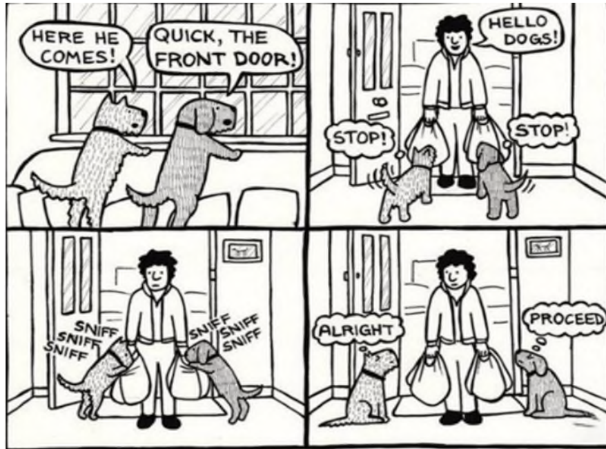
ON RETURNING WITH THE GROCERIES PHILIP ALWAYS HAD TO GO THROUGH 'CUSTOMS'